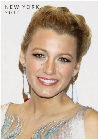
NEW YORK, 2011