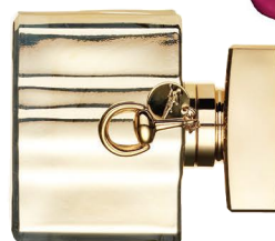
Première EDP, £64 for 50ml, Gucci at Harrods (020 7730 1234)

"When I'm out of town and away from a loved one, I spray Gucci's Première EDP [below left] on my pillow and on my sweater to remind me of home. It's like a little love potion."