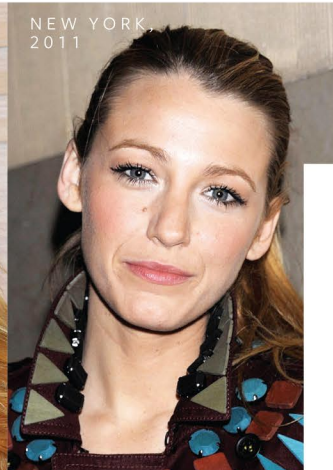
NEW YORK, 2011