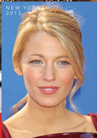
NEW YORK, 2013