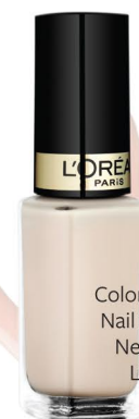
Color Riche Le Blanc Nail Polish in Peach Negligee, £4.99, L'Oréal Paris

"Scented candles are big in my household. I don't want to burn them because they're so pretty. This Le Labo candle [right] is unique as it smells both feminine and masculine."