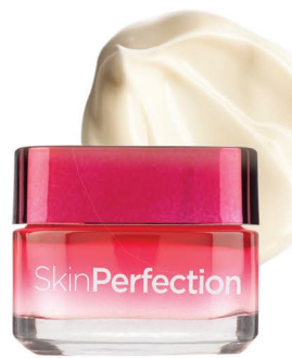
Skin Perfection Day Cream, £14.99, L'Oréal Paris (available nationwide)

It acts as a barrier, so the shampoo takes oil out of the roots only, and the ends stay soft and moisturised."