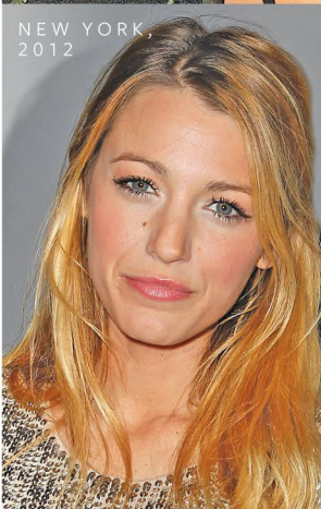
NEW YORK, 2012