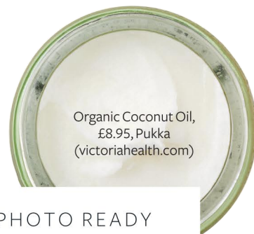
Organic Coconut Oil, £8.95, Pukka (victoriahealth.com)