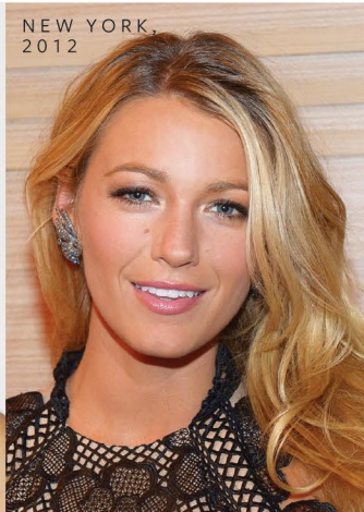
NEW YORK, 2012