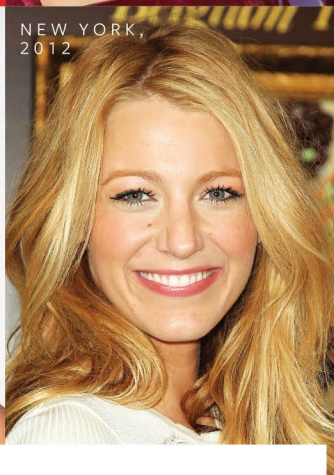
NEW YORK, 2012