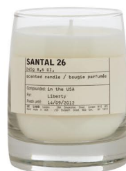
Santal 26 Candle, £47, Le Labo (liberty.co.uk)

"I usually find nude nail polishes are too sheer, but L'Oréal's Color Riche Le Blanc [far right] has a white base, which makes it funkier, younger and more flattering."