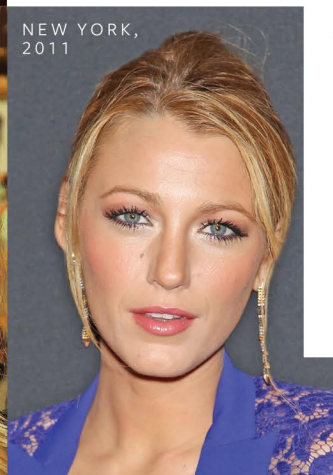
NEW YORK, 2011