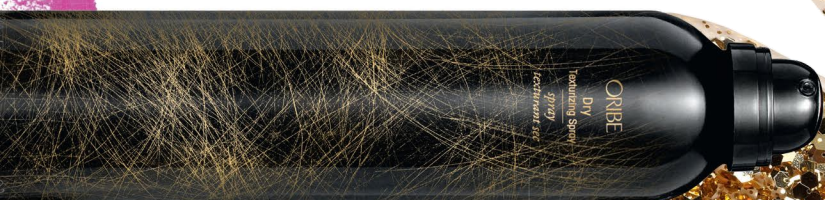
Dry Texturizing Spray, £39, Oribe (spacenk.co.uk)