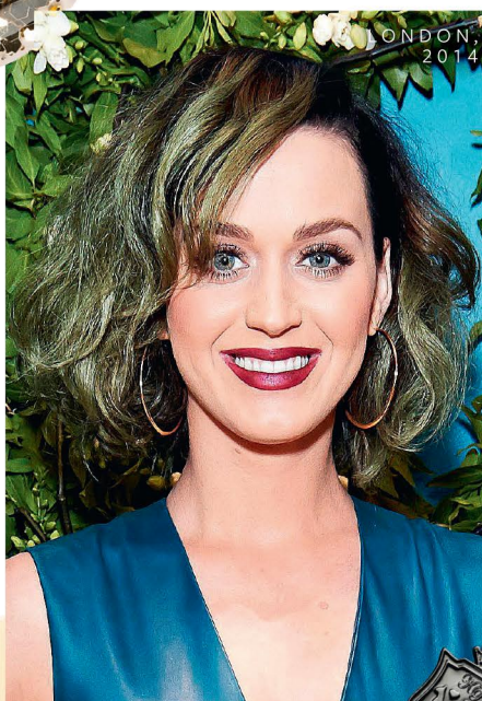
Killer Queen Royal Revolution EDP, £23.50 for 30ml, Katy Perry (available nationwide)