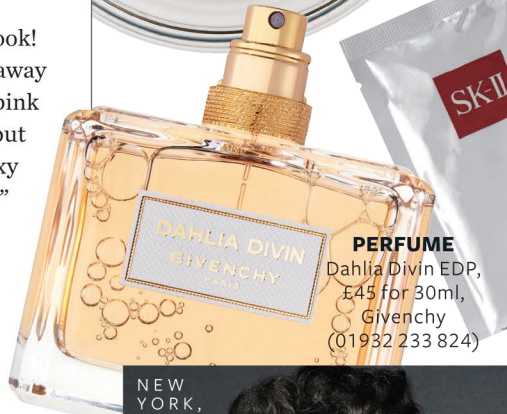
PERFUME Dahlia Divin EDP, £45 for 30ml, Givenchy (01932 233 824)