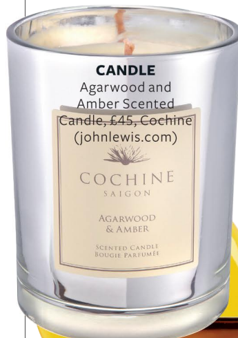
CANDLE Agarwood and Amber Scented Candle, £45, Cochine (johnlewis.com)