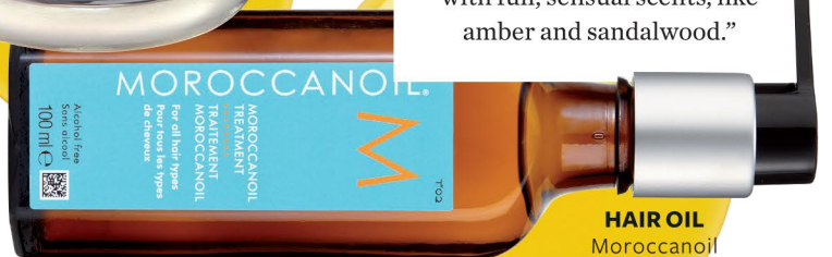
HAIR OIL Moroccanoil Treatment, £31.85, Moroccanoil (moroccanoil.co.uk)