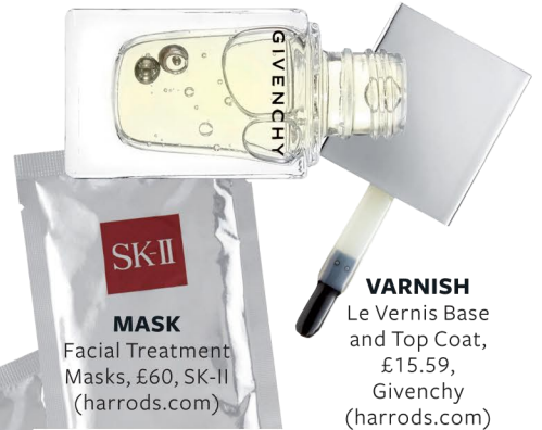
MASK Facial Treatment Masks, £60, SK-II (harrods.com)