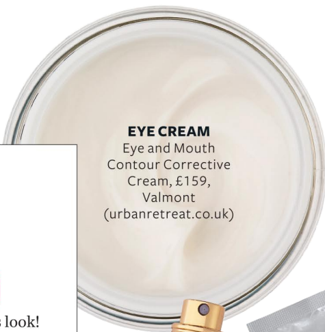
EYE CREAM Eye and Mouth Contour Corrective Cream, £159, Valmont (urbanretreat.co.uk)

"I love this look, too. It feels easy yet strong at the same time. I like to do eyes that aren't too over-the-top. This flick is simple and graphic."