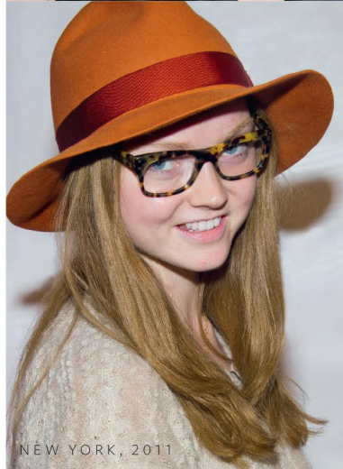
NEW YORK, 2011