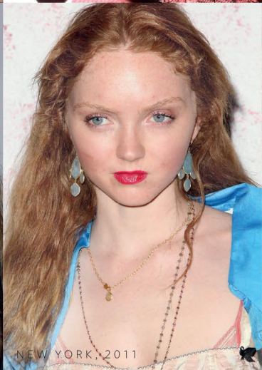
NEW YORK, 2011

NEW FINDS "I like discovering new beauty brands. Often, I'll want to try a product someone has recommended and it'll be a small brand that's tricky to track down. I found La Bella Donna make-up at Beauty Works West in west London. They make great mineral powders with SPF [below] and really good blushers. I also like Cetaphil cleanser."