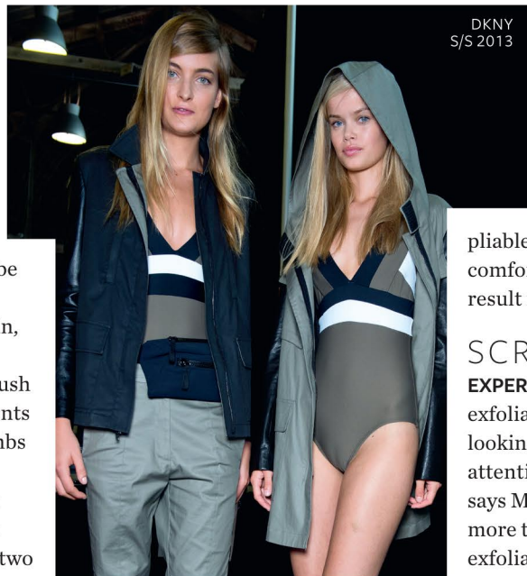
DKNY S/S 2013

pliable, making for a closer, more comfortable shave that’s less likely to result in shaving rash.