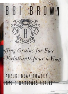
Buffing Grains for Face, £27, Bobbi Brown (bobbibrown.co.uk)