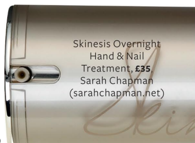
Skinesis Overnight Hand & Nail Treatment, £35, Sarah Chapman (sarahchapman.net)

OUR TIP: Make shaving the last thing you do before you get out of the shower – the longer you leave skin in warm water, the more pores will open and the more hair will become