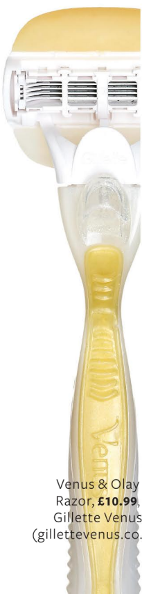
Venus & Olay Razor, £10.99, Gillette Venus (gillettevenus.co.uk)