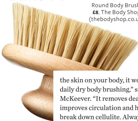
Round Body Brush, £8, The Body Shop (thebodyshop.co.uk)

the skin on your body, it would be daily dry body brushing,” says McKeever. “It removes dead skin, improves circulation and helps break down cellulite. Always brush in firm, long, sweeping movements from the extremities of your limbs towards your heart.”