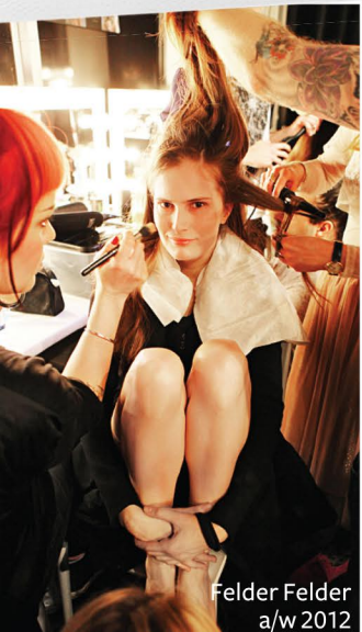
Felder Felder a/w 2012