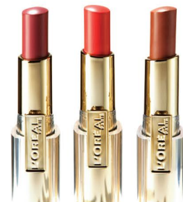
Rouge Caresse in, from left, Sweet Berry; Dating Coral; and Nude Ingenuie, £7.99 each, all L'Oréal Paris (0800 030 4032)

"Press the tip of your finger on to your nail polish just before it dries. Your fingerprint will add a subtle, pretty texture"