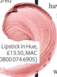
Lipstick in Hue, £13.50, MAC (0800 074 6905)