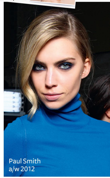
Paul Smith a/w 2012