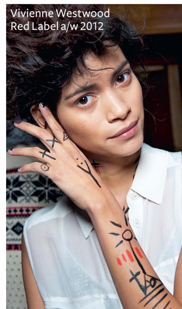
Vivienne Westwood Red Label a/w 2012