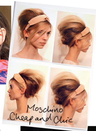
Moschino Cheap and Chic

HIGHLIGHT OF THE DAY: bumping into Pixie Geldof, who came backstage to wish BFF Henry Holland good luck.