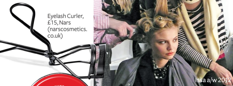
Issa a/w 2012

Eyelash Curler, £15, Nars (narscosmetics.co.uk)