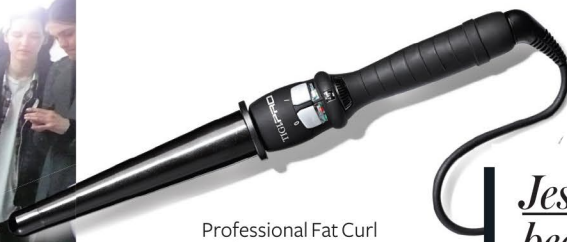
Professional Fat Curl Stick, £39.95, TigiPro (feelunique.com)