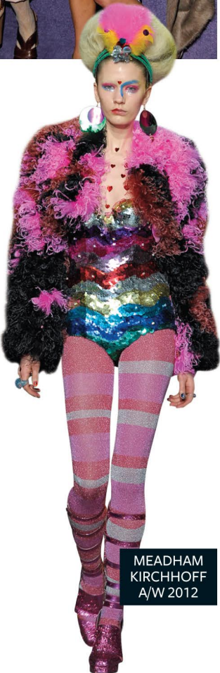
MEADHAM KIRCHHOFF A/W 2012