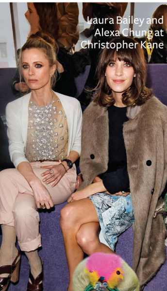
Laura Bailey and Alexa Chung at Christopher Kane

LOOK OF THE DAY: the gold-leaf eye make-up at Michael van der Ham.