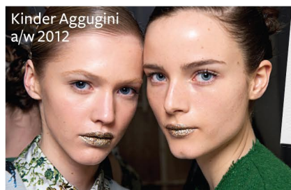
Kinder Aggugini a/w 2012