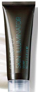
Skin Illuminator in Violet, £12.25, St Tropez (st-tropez.com)

Also seen at: Christopher Kane, Burberry Prorsum, Pringle of Scotland.