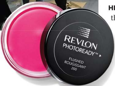
PhotoReady Cream Blush in Flushed, £7.99, Revlon (0800 085 2716)

HIGHLIGHT OF THE DAY: meeting Missy, the Hungarian Puli dog who walked the Mulberry catwalk in a sheepskin coat.