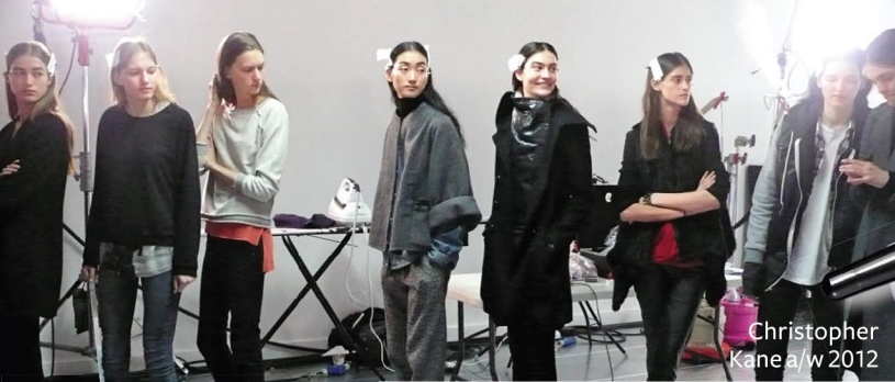
Christopher Kane a/w 2012