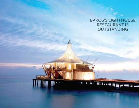
BAROS'S LIGHTHOUSE RESTAURANT IS OUTSTANDING