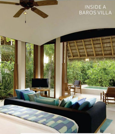
INSIDE A BAROS VILLA

someone's spent hours carefully putting them in place.