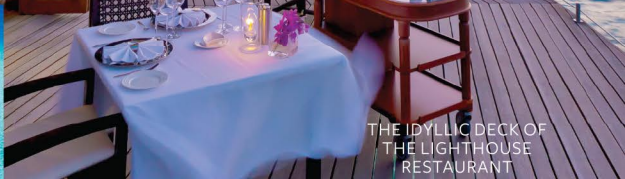
THE IDYLIC DECK OF THE LIGHTHOUSE RESTAURANT