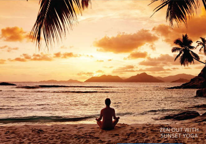
ZEN OUT WITH SUNSET YOGA

one with nature continues outside: the garden leading to the beach isn't perfectly manicured, rather a little wild – dotted with tropical plants and pretty flowers.