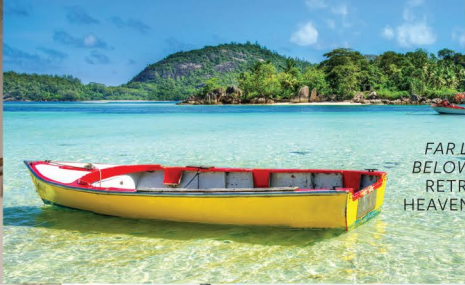
FAR LEFT AND BELOW, A DIBWA RETREAT, AKA HEAVEN ON EARTH