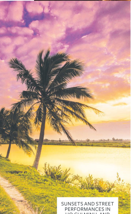
SUNSETS AND STREET PERFORMANCES IN HO CHI MINH, AND HOI AN'S FISHING COMMUNITY, BELOW