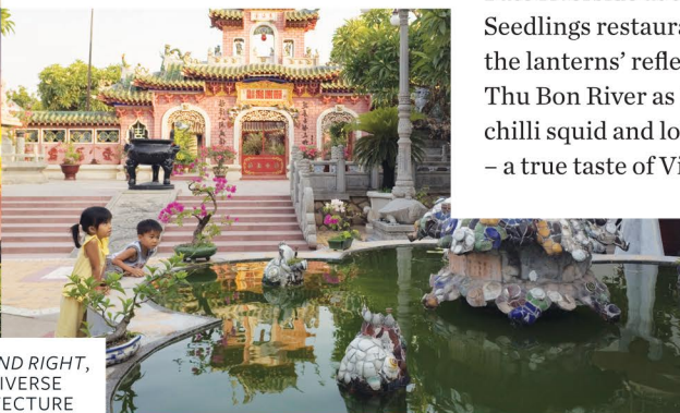
ABOVE AND RIGHT, THE DIVERSE ARCHITECTURE OF HOI AN; BELOW, A RICE PADDY