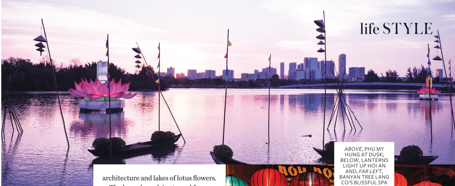
ABOVE, PHU MY HUNG AT DUSK; BELOW, LANTERNS LIGHT UP HOI AN AND, FAR LEFT, BANYAN TREE LANG CO'S BLISSFUL SPA