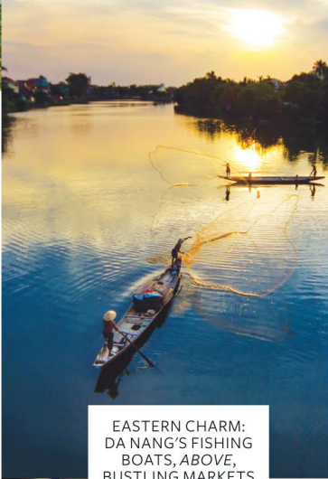
EASTERN CHARM: DA NANG'S FISHING BOATS, ABOVE, BUSTLING MARKETS AND STUNNING BEACHES, BELOW, EPITOMISE VIETNAM

My Vietnamese adventure ended in Da Nang. If you have any space left in your suitcase, this is the perfect stop off for last-minute gifts before you head home. I visited chocolatier Pheva to stock up on boxes of divine locally sourced chocolate. Beautifully packaged and available in unusual flavours including peanut, pistachio and, local favourite, black pepper, it turned out to be the ideal gift for pacifying envious friends back in the UK. A wander down Da Nang's white-sand beach and a final splash in the South China Sea used up the last of my energy, and I could feel my eyelids getting heavy as we approached Da Nang airport in the taxi, ready to fly home. A pre-flight glass of wine was enough to knock me out and I slept like a baby all the way back to the UK, no sleeping pills required. □ A week's stay at Banyan Tree Lang Co starts from £1,899 per person, which includes transfers, return flights with Vietnam Airlines from Gatwick and B&B accommodation in a Lagoon Pool Villa. Book through Western & Oriental (020 7666 1234; wandotravel.com).